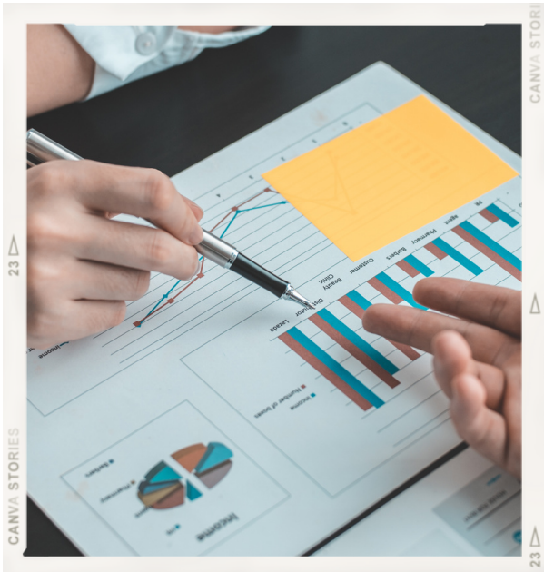
EXPERTISE TO BUILD YOUR BRAND