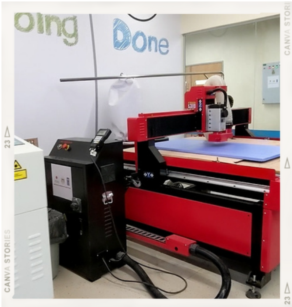
EQUIPPED WITH ADVANCED MACHINERY