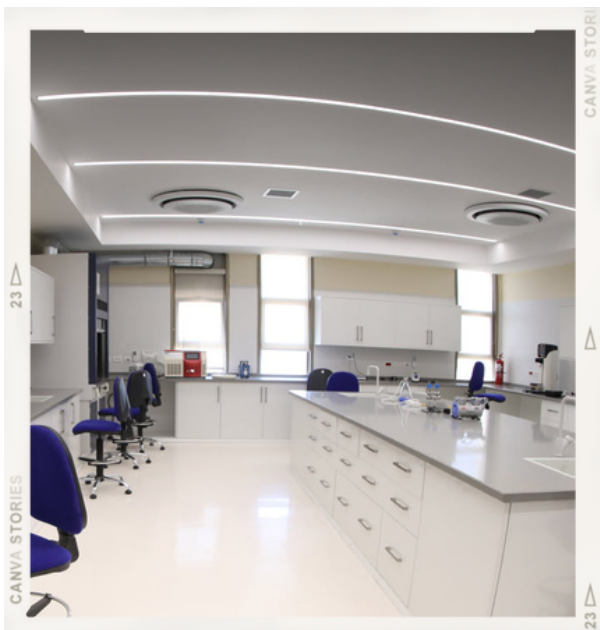
RESEARCH AND DEVELOPMENT SERVICES